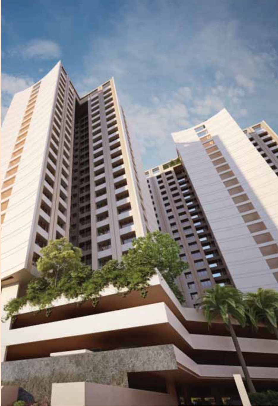
MAHARERA No. P51700001636

The information contained in this brochure is indicative of the kind of development that is proposed. It is prepared and issued in good faith and is for guidance only. It does not constitute part of an offer or contract. Subject to the approval of the authorities or in the interest of the continuing improvement, the developers reserve the right to alter the layout, plans specifications or features without prior notice or obligation.